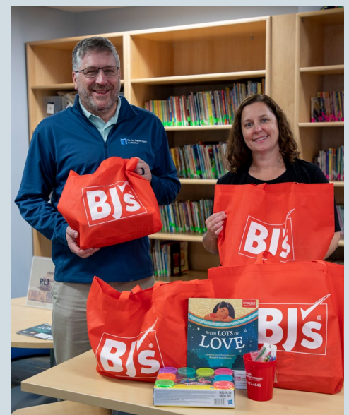
In October 2023, BJ's Wholesale Club donated 50 literacy kits to NECC as part of its Read for the Record event. The kits featured the book, With Lots of Love , as well as activity pages and coloring supplies.

Although he is excited about the fundraising and the impact the donations will make at NECC, he's most excited about experiencing the atmosphere of the NECC 5K. "I personally cannot wait to see the community, the students, and our own team members participate in the event itself," he shared. "It should be a fantastic day with a meaningful impact!"