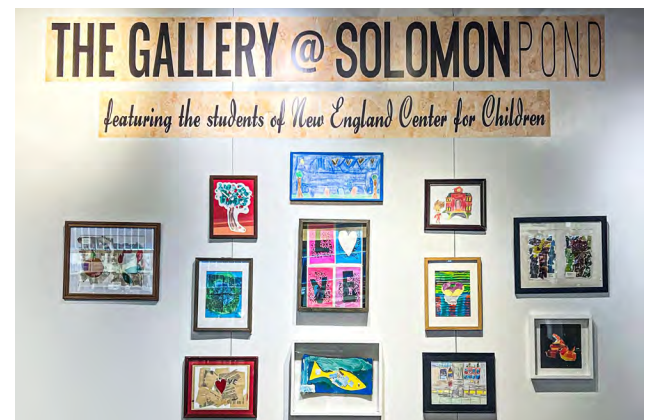
NECC student artwork has been on display at the Solomon Pond Mall in Marlborough, MA. Thank you to Solomon Pond for allowing NECC the opportunity to show off our talented students!