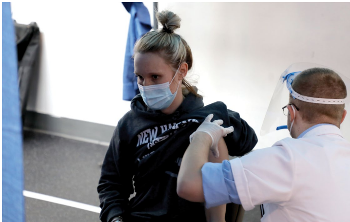
EMT coordinated several COVID vaccine clinics for staff and students, helping the NECC community achieve a 95 percent vaccination rate.