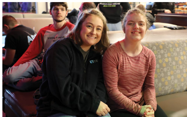
Students and staff enjoyed a day of bowling at Apex Entertainment in Marlborough in March. See more on page 9.